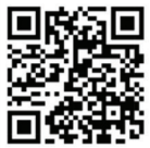
Scan QR Code to find out more about Respite Care

Dear Supporters and Friends of St John's Home,